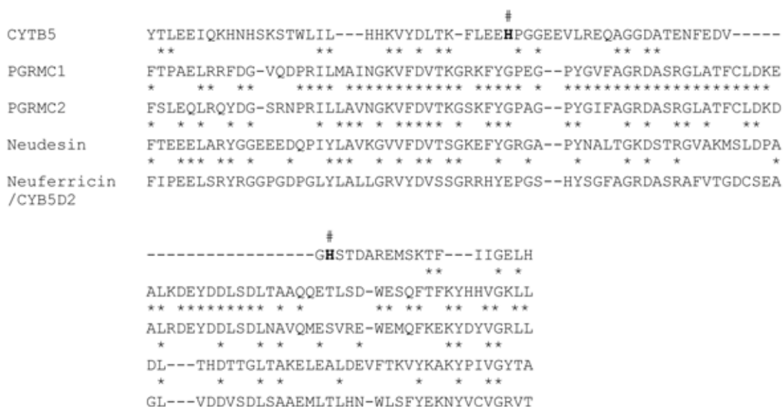
Figure 2. Comparison of amino acid sequences of the b5-like heme-binding domains of human cytochrome b5 and the human MAPR family. Dashes indicate gaps introduced to align sequences. Asterisks indicate identical amino acid residues in the sequences. Sharps indicate two conserved heme-coordinating histidine residues in CYTB5.

Neudesin and Neuferricin/CYB5D2 are expressed in neural tissues at embryonic stages and widely expressed in adult tissues [3, 4, 10]. Neudesin promotes neuronal differentiation and proliferation in neural precursor cells [10, 11]. Neudesin also suppresses adipogenesis in 3T3-L1 cells [12]. Neudesin knockout mice, which are apparently normal and fertile, are protected against high-fat diet-induced obesity, indicating that Neudesin