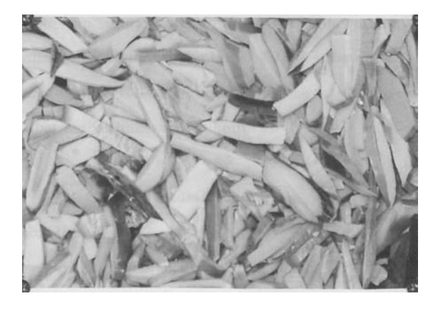
Plate 2. Picture of non-fermented sliced African oil bean.

remove the bitter components of oil bean seeds which are water soluble. After the soaking period, it was drained in a cleaned basket and covered with a clean banana leaf ( Musa sapientum linn ) and kept in a warm place. After some time, the slices were then wrapped in the banana leaf and tied with a string into packages. Each package weighed about 30g. The wraps were then packed inside a container and sterilized in the autoclave at 121°C for 15 minutes and then allowed to ferment in a warm place (30°C - 40°C) for two to three days (see Fig. 1).